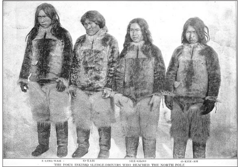
E-GING-WAH - O-TAH - SEE-GLOO - O-KEE-AH THE FOUR ESKIMO SLEDGE-DRIVERS WHO REACHED THE NORTH POLE

“After we returned to the United States I only saw him twice—once, here in New York. I had