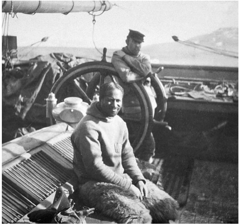
Henson and Peary about 1900 heading for another adventure.

ambition, a voyage of exploration to Greenland. Peary took Henson with, him and there he found the Negro just as useful as he had been in the jungles of Central America. Thereafter Matt Henson was with Robert E. Peary on every one of his Arctic expeditions and became literally, indispensable. On two occasions he saved Peary's life. And he became so wise in the difficulties and necessities of the Arctic that Peary would often defer to his judgment and experience. It was Henson who not only trained the Eskimos but broke in the dogs. His skill in driving the formidable