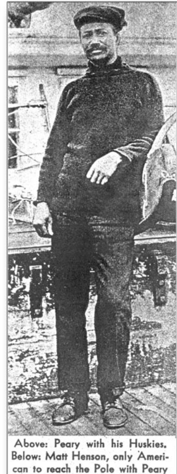
Above: Peary with his Huskies. Below: Matt Henson, only American to reach the Pole with Peary

This criticism, I believe, was unjust. It was disavowed categorically by at least one of those white assistants, Commander MacMillan, who has said to me and stated in public: “We had never expected to go that far. In his letter, offering ‘me the privilege of going along, Peary specifically and emphatically stated: ‘It must be understood that you are not to go to the Pole.’ The same applies to Captain Bob Bartlett.” And MacMillan continued: “The reason for this was quite simple and overwhelming. Henson was the most useful man of us all. He was the best man I’ve ever seen, then or in the thirty years since, in the handling of Eskimos. It was Henson who trained the