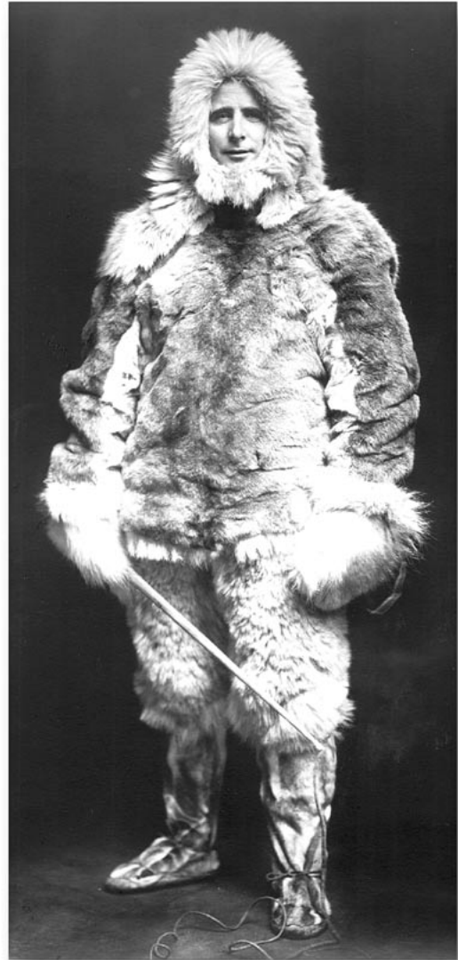
1909 expedition team member Donald MacMillan holds a whip made of walrus hide that was used to control a team of dogs.

In 1891, Peary finally obtained from Morris Jesup the means to carry out a long cherished