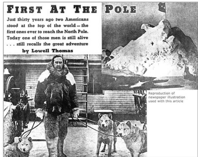
Graphics from the original 1939 newspaper publication

Just thirty years ago two Americans stood at the top of the world—the first ones ever to reach the North Pole. Today one of those men is still alive...still recalls the great adventure